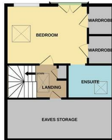
2ND FLOOR 466 sq.ft. (43.3 sq.m.) approx.